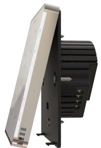
Figure 3: Install Touch Panel Unit

Note: Zero-Cross technology is unavailable if the device operates using DC voltage (24-48VDC).